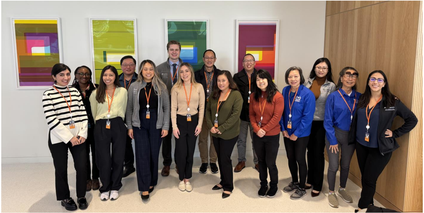
DSHP attendees at posing inside the Genentech Lobby